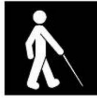
International Symbol of Accessibility for Visually Impaired