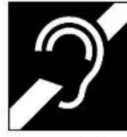
International Symbol of Accessibility for Hearing Impaired