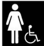
International Symbol of Accessibility combined with Service Identification Signs indicate those facilities which are accessible