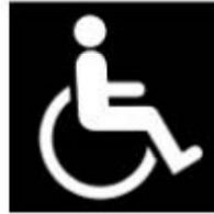
International Symbol of Accessibility for Disabled