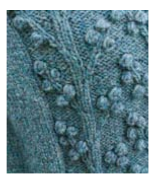
click to enlarge