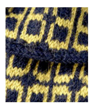
rollover to enlarge