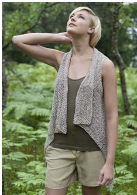
click to enlarge