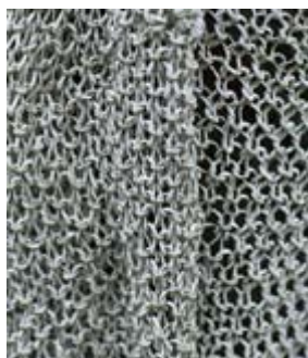
click to enlarge