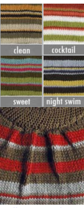
rollover to enlarge