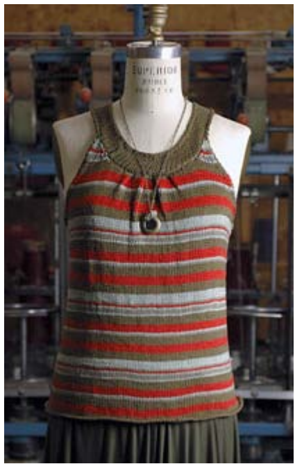
rollover to enlarge