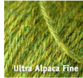
Ultra Alpaca Fine