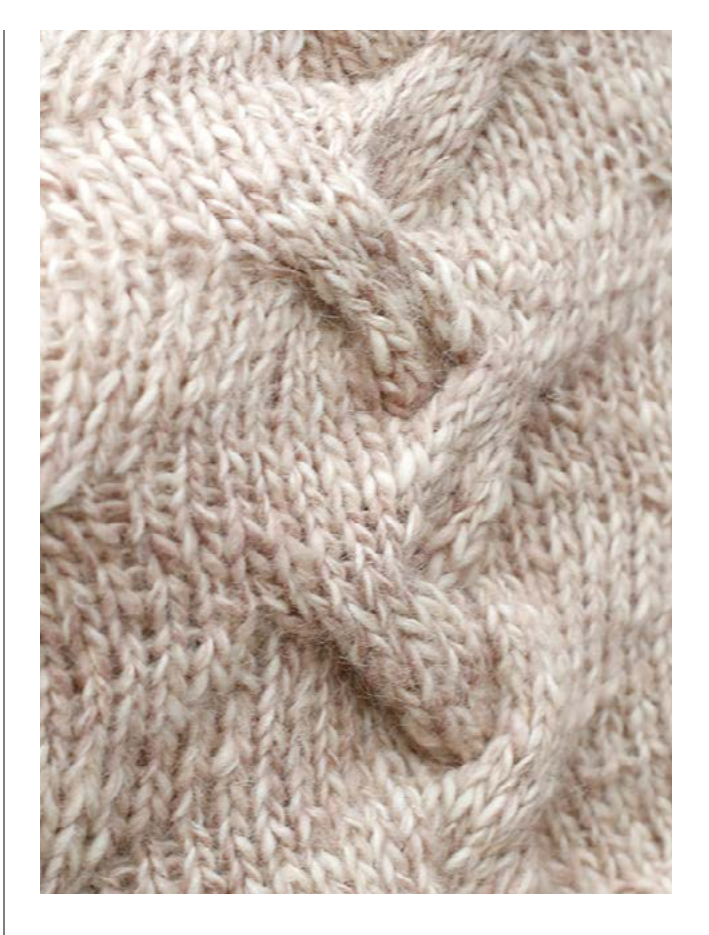
Dec Rnd 4: * SI 5 sts to cn and hold in BACK, k5, k4 from cn, sI last st on cn back to LH needle and k this st and the next st tog, k5, rep from * around – 120(135) sts. Knit 7 rnds.

around, end k2 tog – 128(144) sts. Knit 7 rnds.