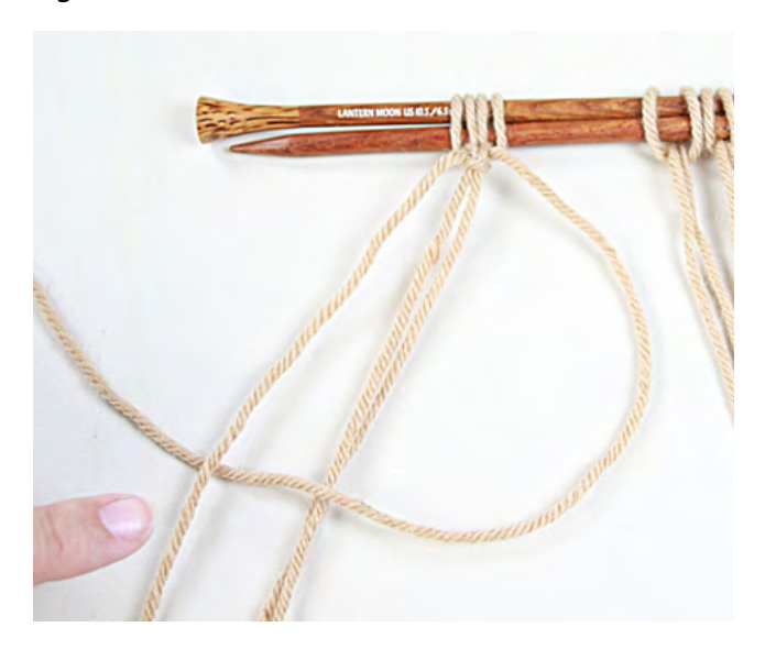
Take the cord on the far left of the group, bring it up over the folded cord, then under the two center cords, then over the cord on the right.