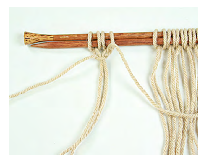
To finish the square, take the cord on the far right and fold it over the two cords to the left (reverse figure 4), then under the far left cord.