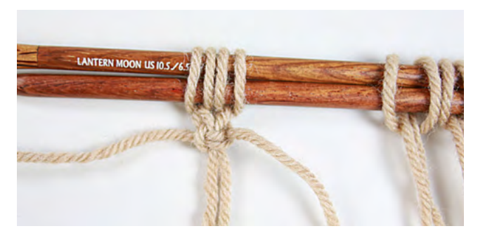
Gathering Cord —Cut a separate length of yarn to gather the threads.

Snug strands up to the top to complete square knot.