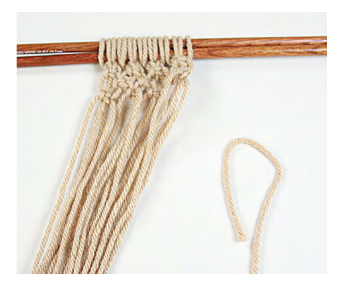
Fold cord slightly and hold against the cords to be wrapped.