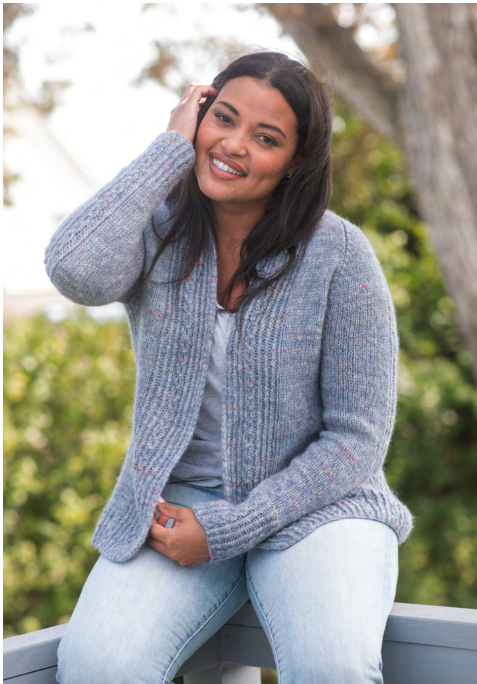
Shown with Glarna

Designed by Alison Green / Skill level: Intermediate