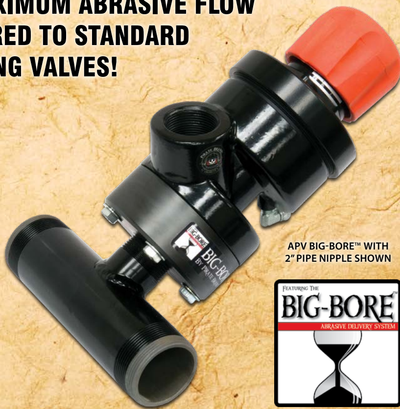
APV BIG-BORE™ WITH 2" PIPE NIPPLE SHOWN