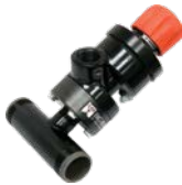
PN: 888-2149-509PB APV BIG-BORE™ METERING VALVE, 2", W/TUNGSTEN CARBIDE SLEEVE