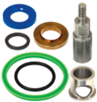
PN: 888-2149-50099PB APV BIG-BORE™, REPAIR KIT W/TC SLEEVE, INCLUDES # 6, 8, 11, 12, 13, 14 & 15