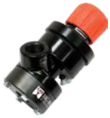
PN: 888-2149-500PB APV BIG-BORE™ METERING VALVE W/TUNGSTEN CARBIDE SLEEVE (PIPE NIPPLE NOT INCLUDED)