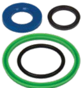
PN: 888-2149-50098PB APV BIG-BORE™, SEAL KIT W/TC SLEEVE, INCLUDES # 6, 11, 13, & 15