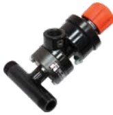
PN: 888-2149-508PB APV BIG-BORE™ METERING VALVE, 1½", W/TUNGSTEN CARBIDE SLEEVE