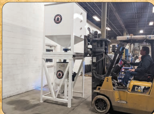
5) Hopper is placed back into base.