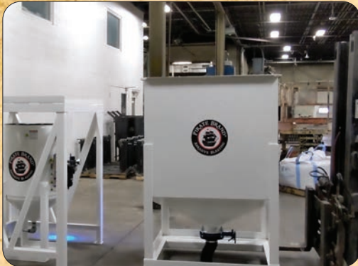
1) Hopper is placed on the ground via forklift.