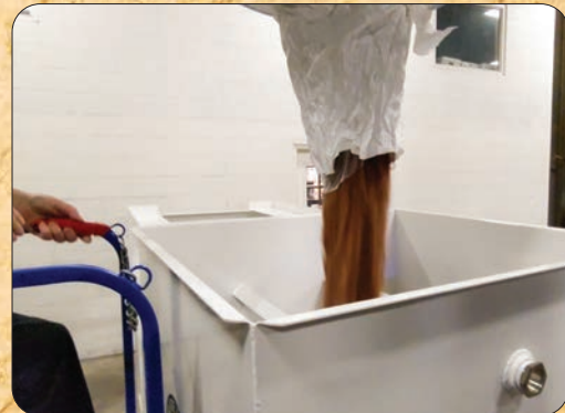
4) Abrasive is released into hopper.