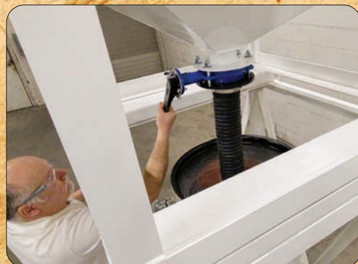
6) Butterfly valve is opened, loading abrasive into vessel.