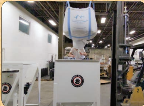
3) Bulk bag is positioned above hopper and prepped for abrasive release.