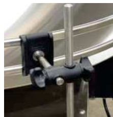
Tool-less rail adjustments