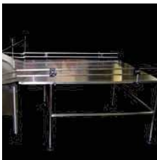
Dead-plate table available in many sizes