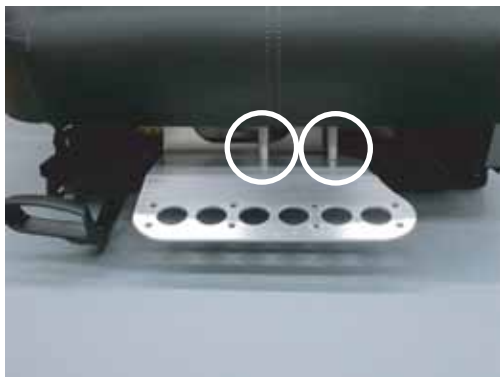
Step 6 - Tighten all bolts.