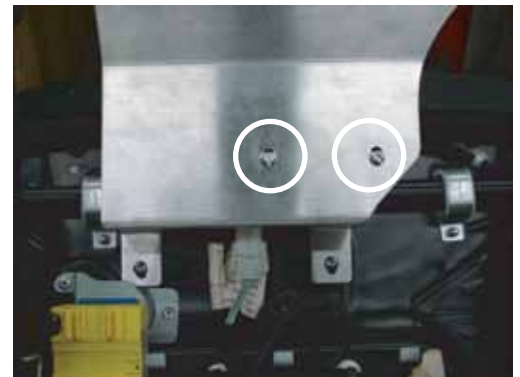
Step 5 - Install the 2 front mounting points using the supplied spacers, 2.25" socket head cap screws and washers. See step 6 for spacer placement.