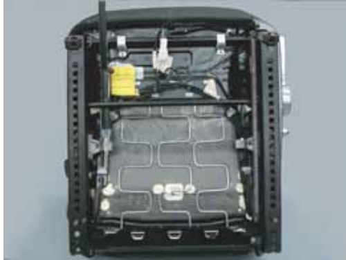
Step 1 - Remove drivers seat from car and position it so you can access seat bottom as shown.