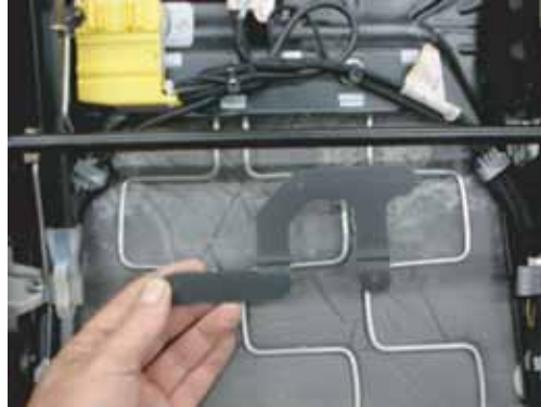
Step 2 - Place the black mounting bracket between the seat springs and seat cushion as shown in the above photos. Slide the bracket up toward the front of the seat until the holes line up with the factory holes shown in step 3. To make this step easier wedge something between the cushion and springs to give you clearance to position the bracket.