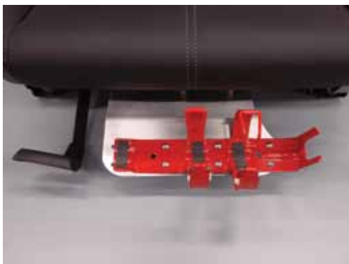
Step 7 - Install fire extinguisher bracket using the supplied (6) 10/32 button head screws, washers and nuts. This mount was designed for a standard Hal Guard bracket. If your mounting holes are different you may need to drill your bracket to properly fit. Note: Bracket placement and orientation will vary for power and manual seats.