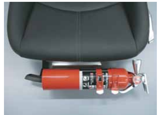
Step 8 - Install seat back into car and attach fire extinguisher.