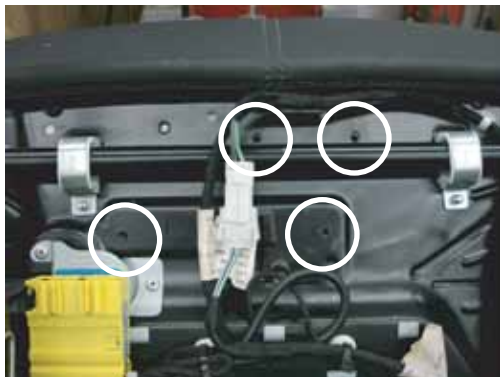
Step 3 - Align bracket with these (4) holes. A small screw driver or punch will help you to position bracket.