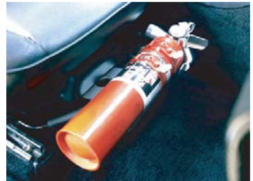
Step 9 - Install seat back into car and attach fire extinguisher