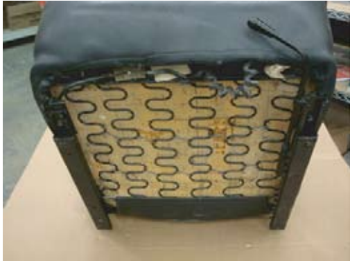
Step 1 - Remove seat from car and position it so you can access seat bottom as shown.