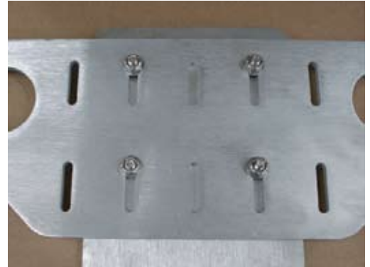
Step 3 -Assemble bracket A+B as shown using the supplied 10/32 X.625" button head screws, nuts and washers. Leave screws loose so that adjustment can be made in step 8.