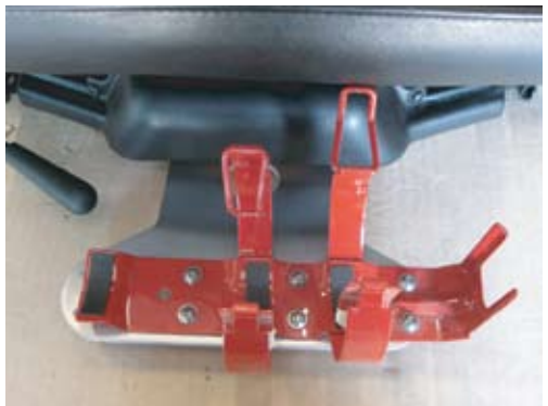
Step 7 - Install fire extinguisher bracket using the supplied (6) 10/32X.5"button head screws, washers and nuts. This mount was designed for a standard Hal Guard bracket. If your mounting holes are different you may need to drill your bracket to properly fit.