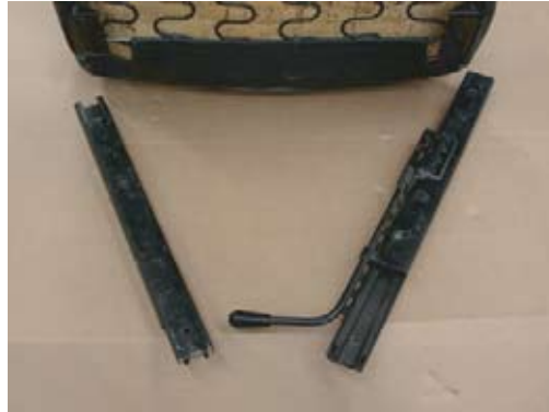
Step 2 - Remove seat rails.