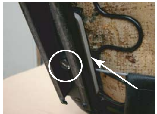
Step 6 - Insert the 2 spacer plates between the seat and the seat rail on the back 2 mounting points as shown using the supplied M6 bolts and washers. Once in place tighten all 4 mounting points .