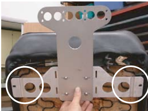
Step 4 - Position aluminum assembly on seat by aligning to (2) bolt holes with the seat rail mounting holes. Make sure that the machined grooves are pointing down.