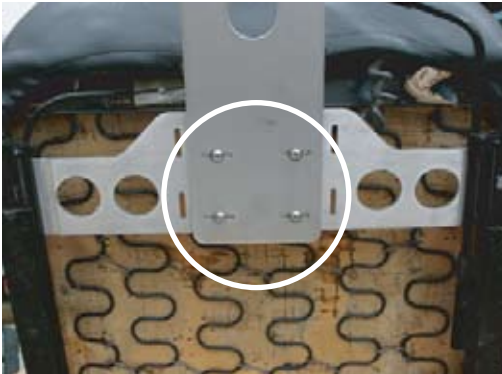
Step 8 - Adjust the fire extinguisher to the desired location and tighten the 4 button head screws that were installed in step 3.