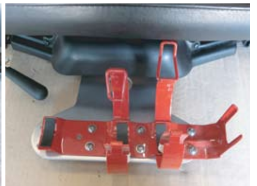
Step 9 - Install fire extinguisher bracket using the supplied (6) button head screws, washers and nuts. This mount was designed for a standard Hal Guard bracket. If your mounting holes are different you may need to drill your bracket to properly fit. Install seat into car.