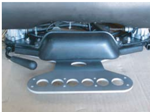
Step 8 - Reinstall plastic motor cover.