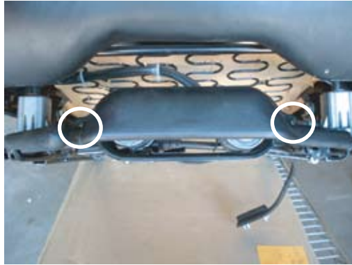
Step 2 - Remove plastic motor cover. Step 3-5 describes the installation of a stiffener plate that is designed for use in high vibration environments. Its not required but recommended. If your not using the stiffener plate skip to step 6