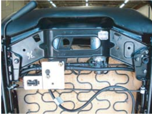
Step 1 - Remove seat from car and position it so you can access seat bottom as shown.