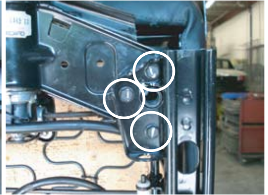
Step 3 - Remove the (3) M6 bolts that attach the seat actuator. Only remove one side of the seat at a time.