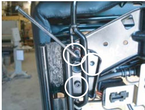
Step 5 - Repeat steps 3 & 4 on the other side of the seat. You must rotate the slider arm to access (2) of these mounting bolts.