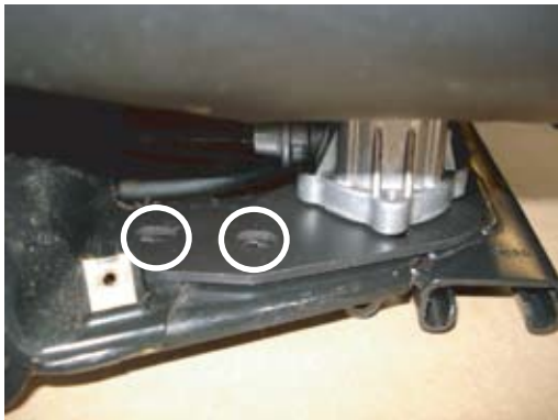
Step 4 - Insert stiffening plate between the actuator and the motor bracket. Install the supplied M6 X16mm bolts and washers as removed from step 3. Make sure that the (2) holes are aligned as shown above.