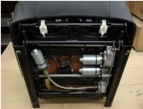
Step 1 - Remove seat from car and position it so you can access seat bottom as shown.

Note: For use on factory driver or passenger side seats (due to some factory options, this unit may not work on all driver side seats with seat in the lowest position).