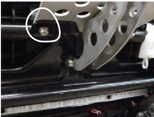
Step 3 - Attach the aluminum face plate to the seat and the S/S bracket as shown above using the supplied 8/32 button head screws, nuts and washers. Leave all hardware loose until everything is in place, and then tighten hardware.