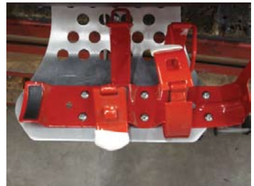
Step 4 - Install fire extinguisher bracket using the supplied (6) 10/32 button head screws, washers and nuts. This mount was designed for a standard Hal Guard bracket. If your mounting holes are different you may need to drill your bracket to properly fit. Install seat into car.