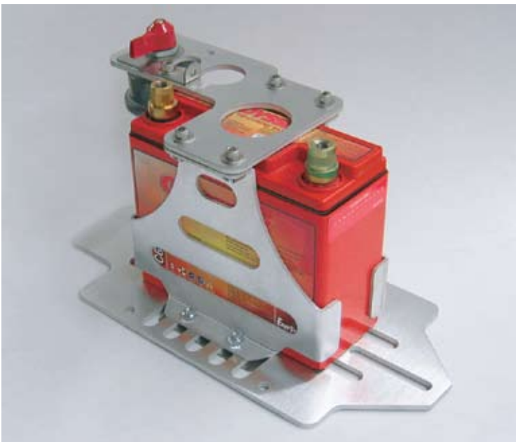
Odyssey 680 with switch mount top and 911/996

Here are a few photos of different configurations.