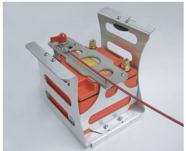
Odyssey 925 with smugglers box relocation cradle