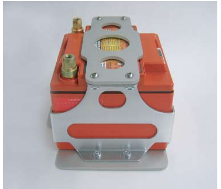
Odyssey 925 without switch mount top and 911/996