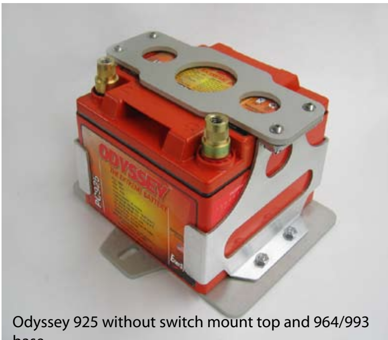
Odyssey 925 without switch mount top and 964/993 base