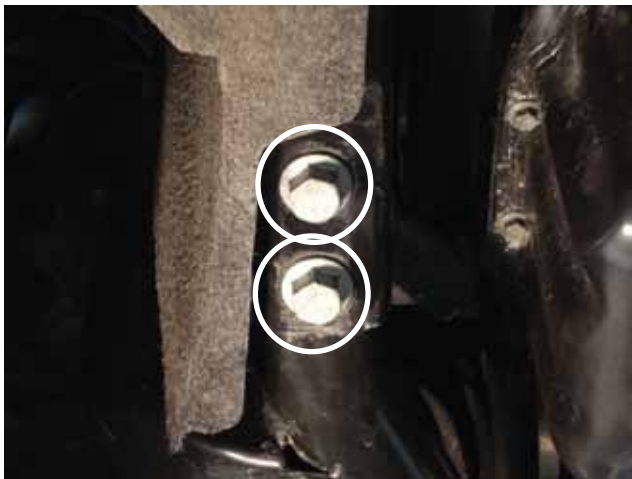
Step 2 - Remove the (2) Subframe bolts on each side of the car and install the skid plate brackets as shown above. Note: Work on one side of the car at a time.