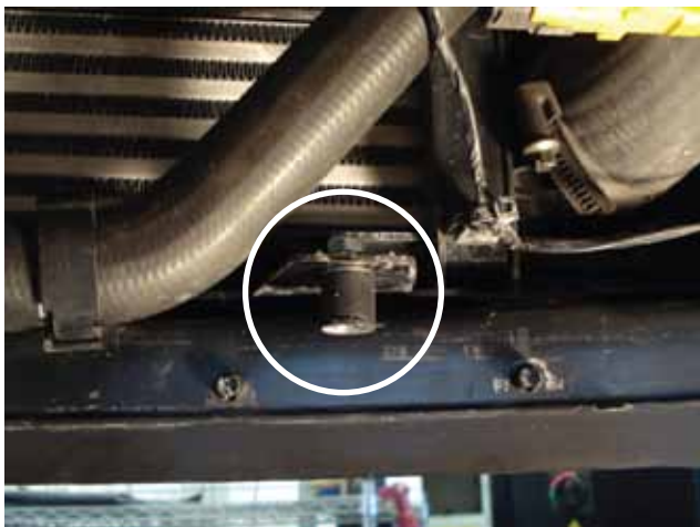
Step 3 - Install the (2) rubber standoffs as shown above. Using the supplied nuts and washer.