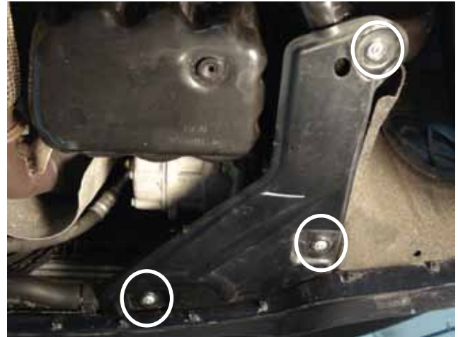
Step 1 - Remove the (2) plastic covers as shown above. These will not be reused.