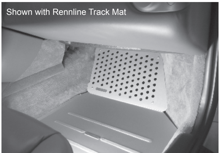
Shown with Rennline Track Mat