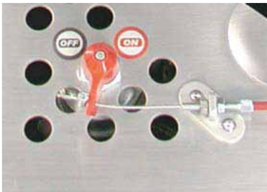
Integrated Kill Switch

Here's a few photos of available options