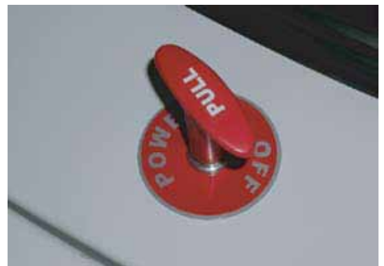
Remote kill switch pull