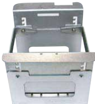
Battery Relocation Cradle