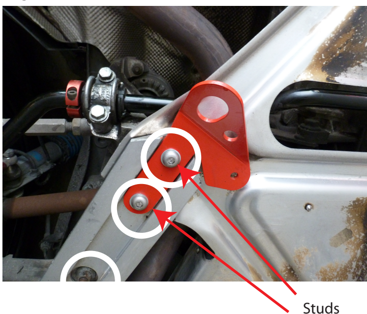
Fig 1 Early Application