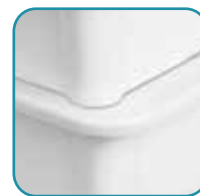
Seamless fit for fresh storage