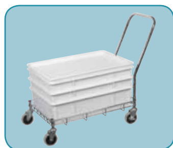
Transport dough boxes