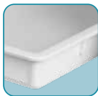
Reinforced edges & corners