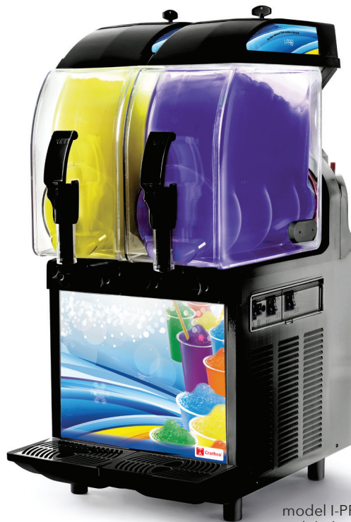
model I-PRO 2M with light panel