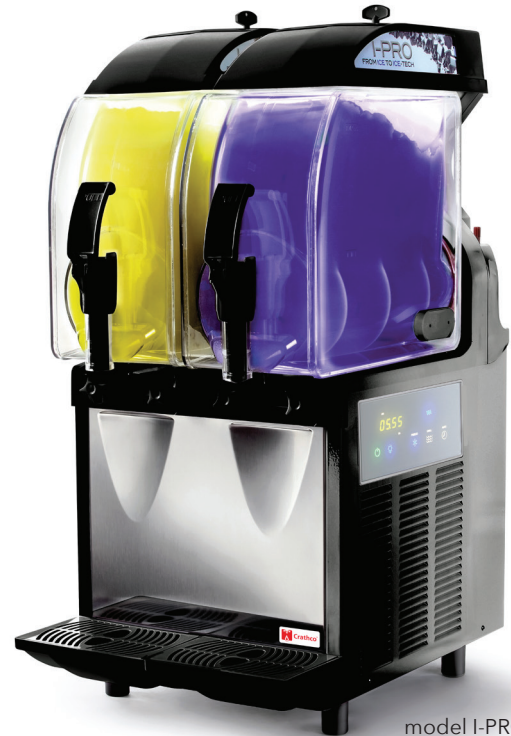
model I-PRO 2E