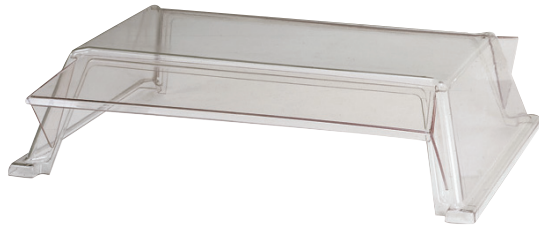
50SG-2D with optional sneeze guard shields

Polycarbonate with Two [2] Doors 20SG-2D 30SG-2D 45SG-2D 50SG-2D 75SG-2D