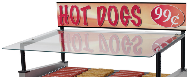
50SG-G with optional sign holder