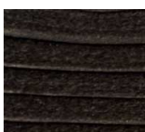
A9 - Vulcano cedar (essence available for indoor use only)