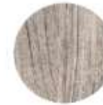
Rustic Grey Washed