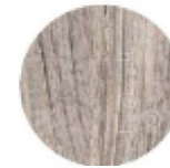
Rustic Grey Washed