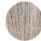
Rustic Grey Washed