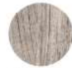
Rustic Grey Washed