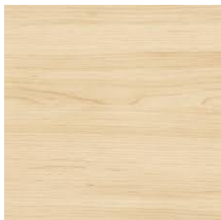
NATURAL BEECH WOOD