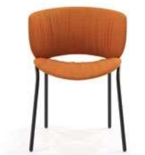
Funda chair 4 metal legs