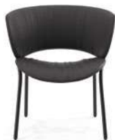
Funda armchair 4 metal legs

Both of its parts - structure and technical cover - can be recycled independently, extending its lifecycle and fostering circular economy. With Funda we optimize resources, without compromising on comfort, durability or resistance.