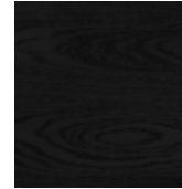
oak 13 black oak