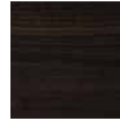
veneer smoked eucalyptus