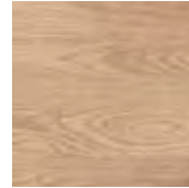
oak 12 light oak