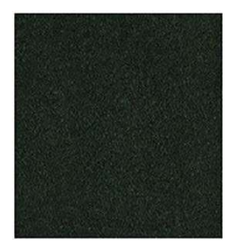
04 MOSS GREEN