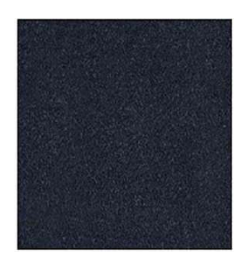
05 MIDNIGHT BLUE