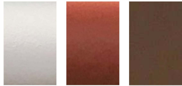
15PL RAL1015 17PL RAL8012 18PL RAL8014