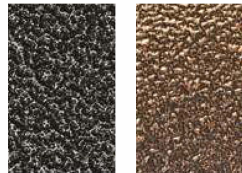
1MT BLACK 2MT COPPER