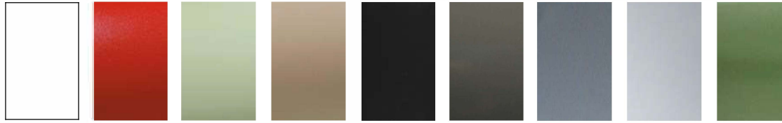
1PL RAL9010 3PL RAL3000 4PL RAL6019 5PL RAL1019 7PL RAL9005 8PL RAL7024 9PL RAL9006 10PL RAL9006 13PL RAL6003