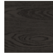
oak 15 dark olive grey oak