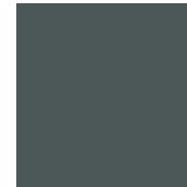
C35 petrol grey