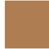
C36 tanned skin