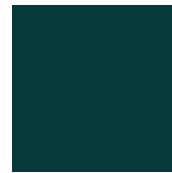
C39 dark petrol