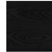
oak 13 black oak