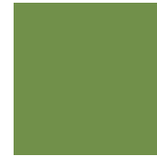
C34 pale green