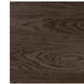
oak 14 light chocolate oak