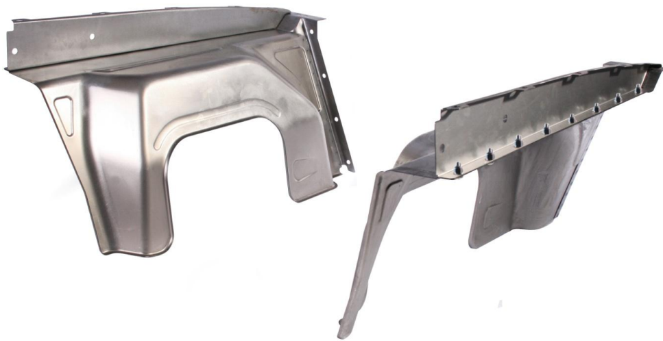
P/N: 032035DS - 1962-1965 Chevy II Inner Fenders Shown

Detroit Speed's Chevy II inner fenders are designed to fit Chevy IIs equipped with a Detroit Speed Chevy II Front Frame. They completely hide the Front frame bay bars resulting in a neat and clean under hood appearance. The inner fenders are stamped from 18-gauge steel and are made in the USA.