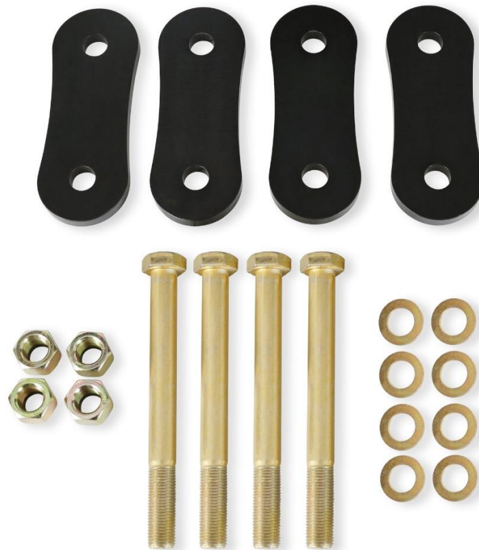
PN: 041508DS Shown

Upgrade your rear leaf spring shackles with the DSE Heavy Duty Shackle Kit. The kit includes zinc plated heavy duty steel shackles, Grade 8 Hex Head bolts, Nylock nuts and AN washers.