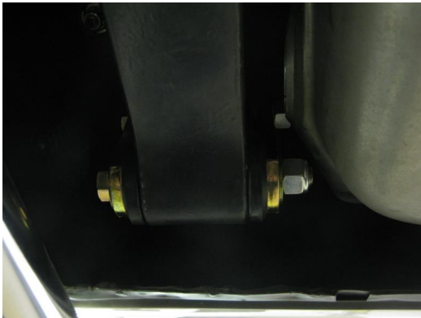
Figure 2 – Rear Leaf Spring Shackles Installed