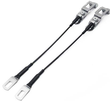
P/N: 012020DS Shown

Upgrade the function and finish of your Chevrolet and GMC tailgate with Detroit Speed Tailgate Cables. Designed to replace outdated steel support rods, these modern rubber-coated cables provide a cleaner appearance and eliminate the rattle and vibration that plague vintage tailgates.