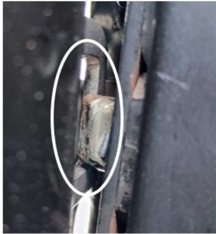
Correct Latch Engagement