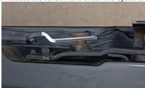
Cable Eyelet Orientation – tailgate pivot