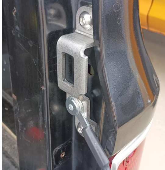
Install latch bracket / cable assembly

The latch bracket allows adjustment for final tailgate fit. It is recommended to start with the hardware centered in the adjustment slots. Final fitment will be adjusted once both sides have been installed.