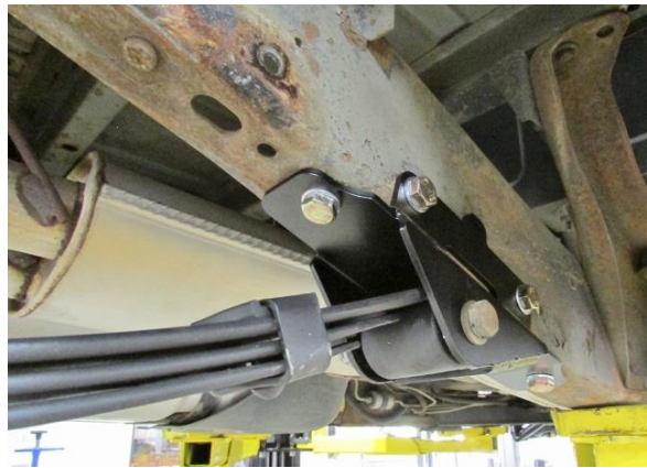
Figure 5 - Install Leaf Springs