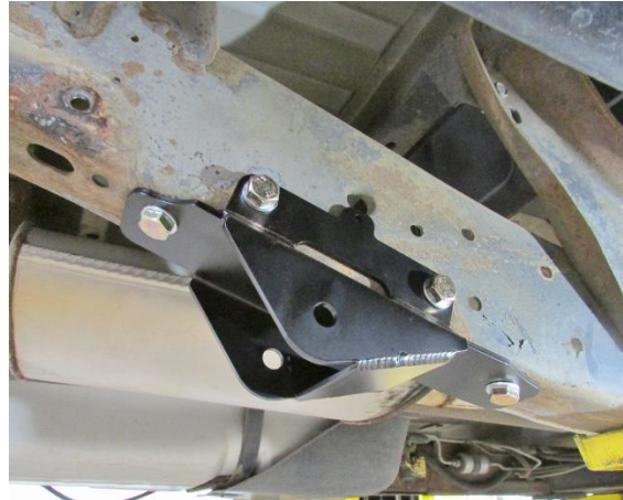
Figure 4 - Install Front Mounts