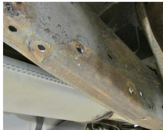
Figure 3 - Remove Front Mounts