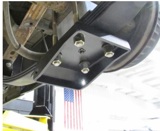
Figure 6 - Install Spring Plates