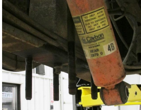
Figure 1 - Disconnect Shocks and Remove Spring Plates