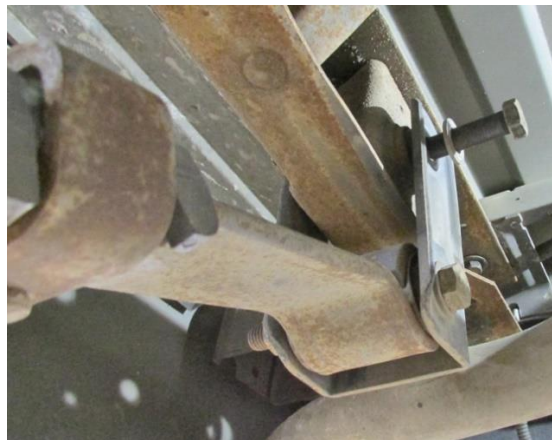
Figure 2 - Remove Leaf Springs