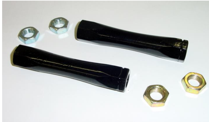
Figure 2 – Billet Tie Rod Adjusters