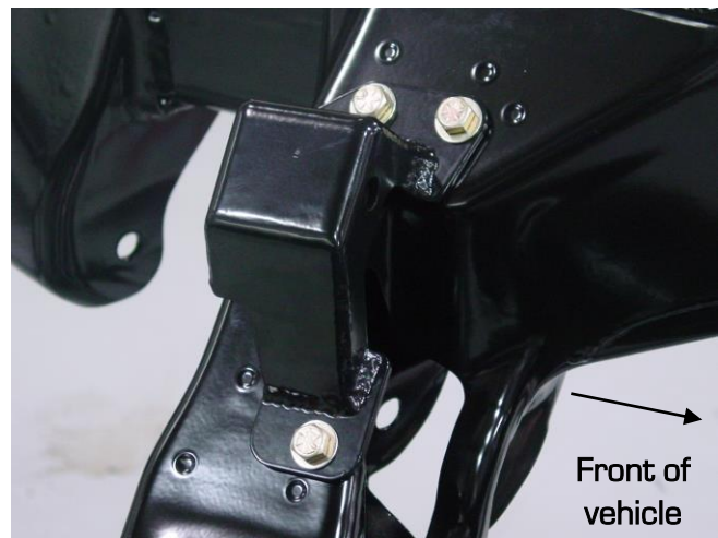
Figure 2 - LH engine stand