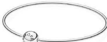
ESSENCE COLLECTION Bangle Bracelet