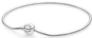
ESSENCE COLLECTION Bracelet