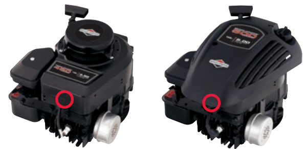
400 Series™, 500 Series™ Classic™, Sprint™, SO™, Q™