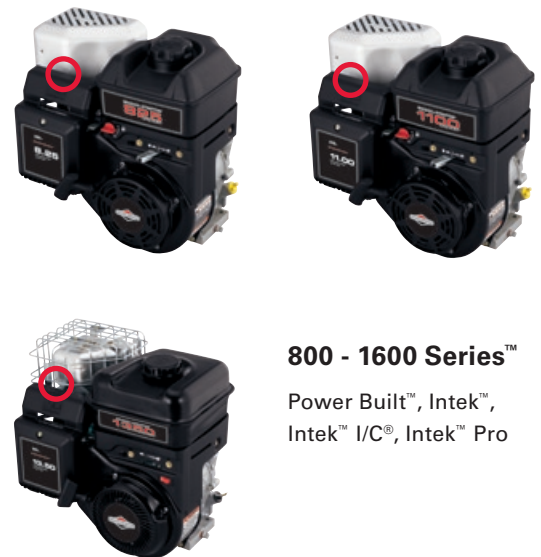
800 - 1600 Series™

Power Built™, Intek™, Intek™ I/C®, Intek™ Pro