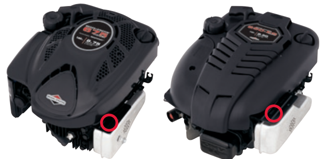
600 Series™, 800 Series™ Quantum®, Intek™