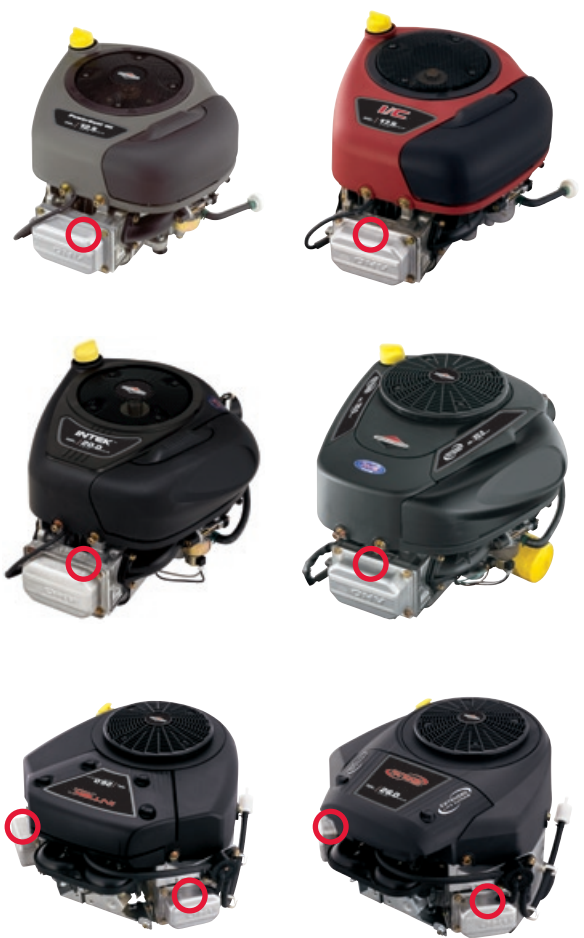
Power Built™ Series, I/C® Series™, Intek™ Series™, Extended Life Series®