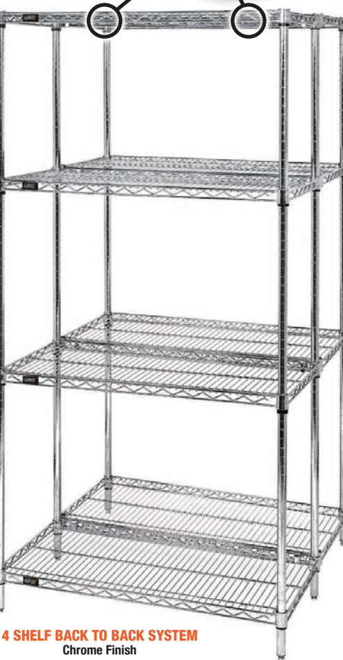
4 SHELF BACK TO BACK SYSTEM Chrome Finish