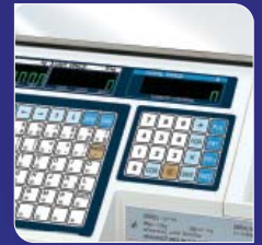
54 Direct PLU keys