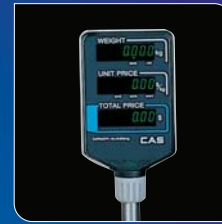
Pole Display Option