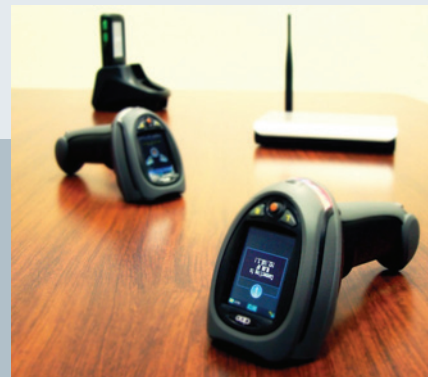
Enterprise Wireless Solution

The Wi-Fi scanner can be easily integrated into an existing enterprise wireless network infrastructure with minimum effort. It not only reduces capital expenditures but also improves the return on investment.