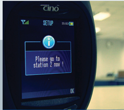
Remote Control Feature