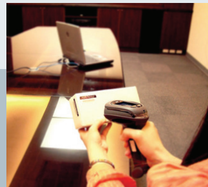
On Line Scanning