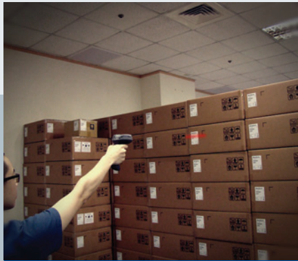
Two Models Available

When using Wi-Fi scanner together with Cino WaveCentre software, the useful remote control function enables you to send remote messages, lock or unlock one or multiple Wi-Fi scanners from remote host wirelessly. Furthermore, you can transmit scanned data through either virtual COM or HID.