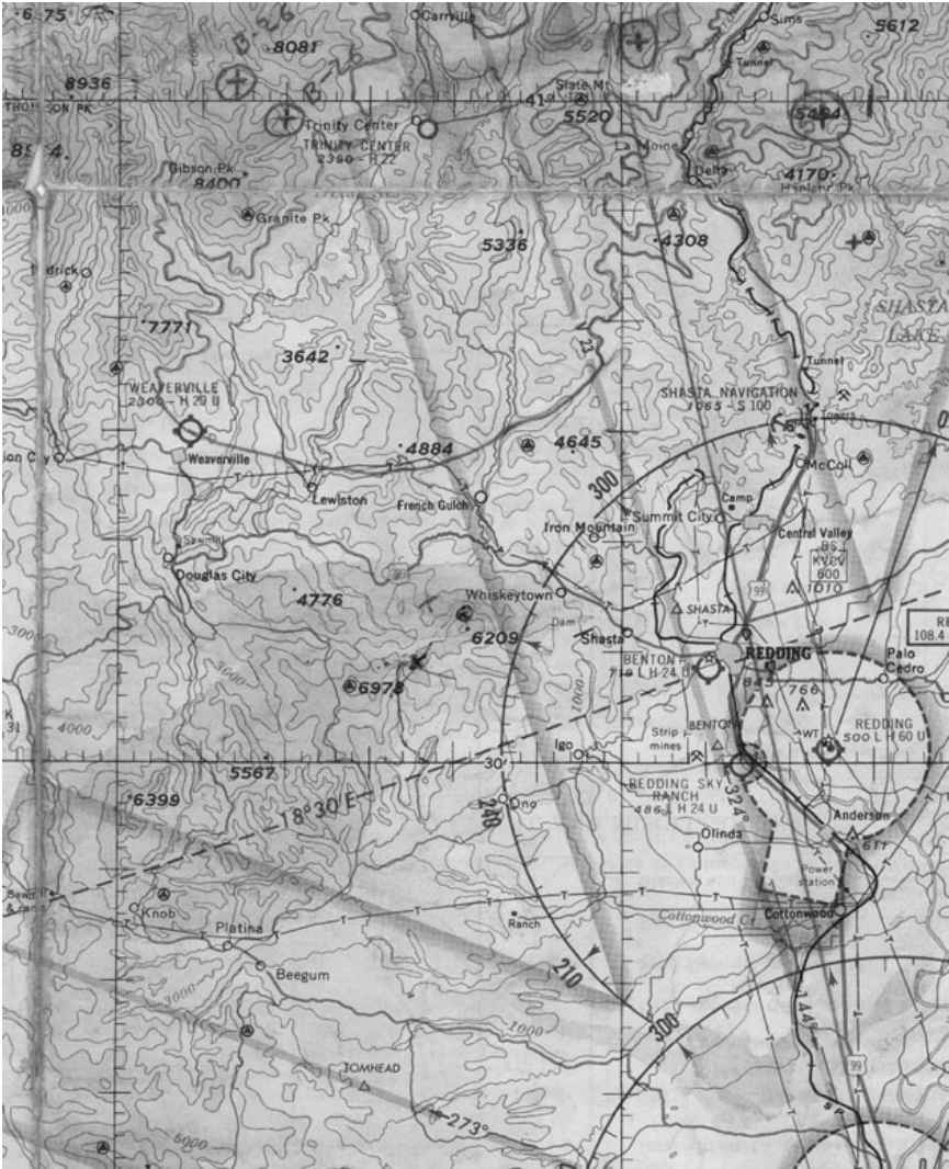
From the well-pored-over, often-folded sectional-aeronautical map of the Trinity Mountains area of Northern California that the Oien brothers used while searching for their dad's downed Cessna 195. Al Jr. indicated in pencil several other wrecks he found by circled-airplane symbols.