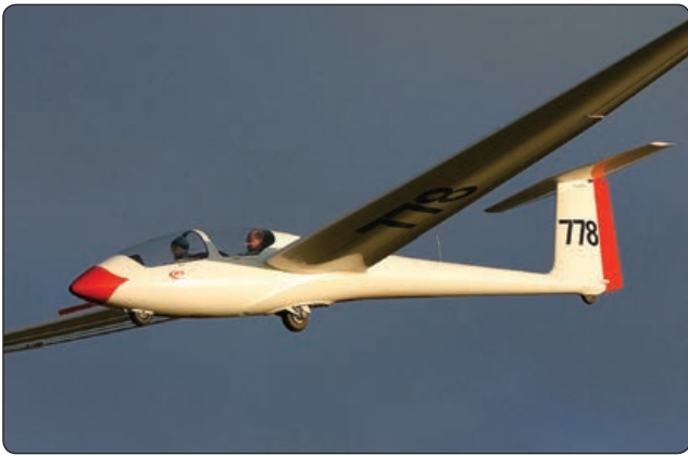
Figure 1-6. A sailplane is a glider designed to fly efficiently and gain altitude solely from natural forces, such as thermals and ridge waves.

Another widely accepted term used in the industry is sailplane. A sailplane is a glider (heavier-than-air fixed-wing aircraft) designed to fly efficiently and gain altitude solely from natural forces, such as thermals and ridge waves. [Figure 1-6] Older gliders and those used by the military were not generally designed to gain altitude in lifting conditions, whereas modern day sailplanes are designed to gain altitude in various conditions of lift. Some sailplanes are equipped with sustaining engines to enable level flight even in light sink, or areas of descending air flow. More sophisticated sailplanes may have engines powerful enough to allow takeoffs and climbs to soaring altitudes. In both cases, the powerplants and propellers are designed to be stopped in flight and retracted into the body of the sailplane to retain the high efficiency necessary for nonpowered flight.