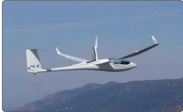
Figure 1-7. An ASH 26 E self-launching sailplane with the propeller extended.

Self-launching gliders are equipped with engines; with the engine shut down, they display the same flight characteristics as nonpowered gliders. [Figure 1-7] The engine allows them to be launched under their own power. Once aloft, pilots of self-launching gliders can shut down the engine and fly with the power off. The additional training and procedures required to earn a self-launch endorsement are covered later in this handbook.