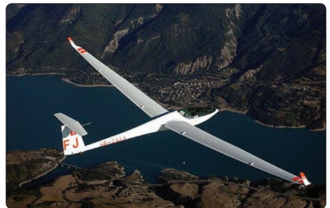
Figure 1-5. A Schleicher ASK 21 glider.

The Federal Aviation Administration (FAA) defines a glider as a heavier-than-air aircraft that is supported in flight by the dynamic reaction of the air against its lifting surfaces, and whose free flight does not depend principally on an engine. [Figure 1-5] The term “glider” is used to designate the rating