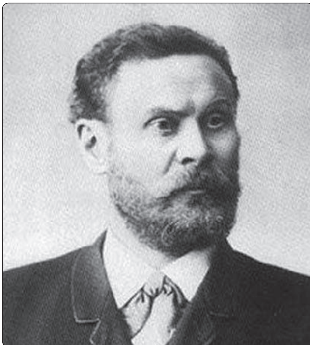
Figure 1-2. Otto Lilienthal (May 23, 1848–August 10, 1896) was a German pioneer of human aviation.

Otto Lilienthal was a German pioneer of human flight who became known as the Glider King. [Figure 1-2] He was the first person to make well-documented, repeated, successful gliding flights beginning in 1891. [Figure 1-3] He followed an experimental approach established earlier by Sir George