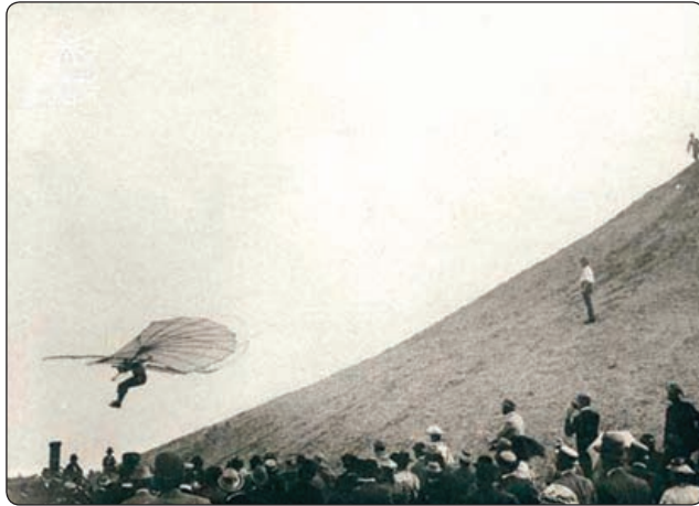
Figure 1-3. Otto Lilienthal in flight.

of Kitty Hawk, North Carolina. [Figure 1-4] The Wrights developed a series of gliders while experimenting with aerodynamics, which was crucial to developing a workable control system. Many historians, and most importantly the Wrights themselves, pointed out that their game plan was to learn flight control and become pilots specifically by soaring, whereas all the other experimenters rushed to add power without refining flight control. By 1903, Orville and Wilbur Wright had achieved powered flight of just over a minute by putting an engine on their best glider design.