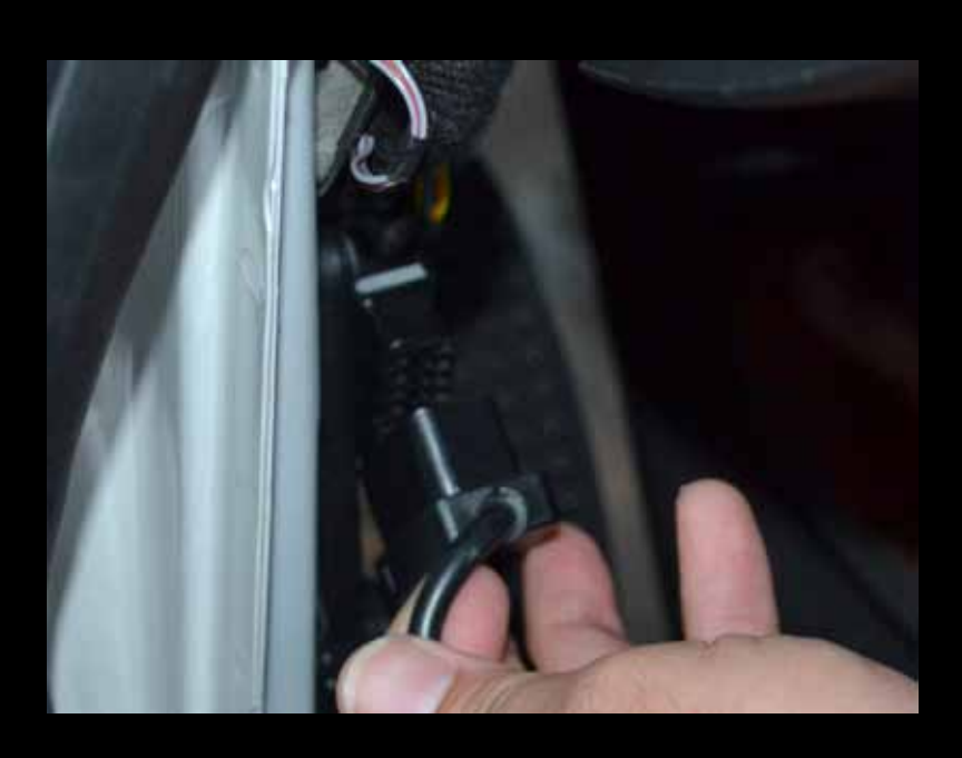
Plug in the obd2 connector to the car.