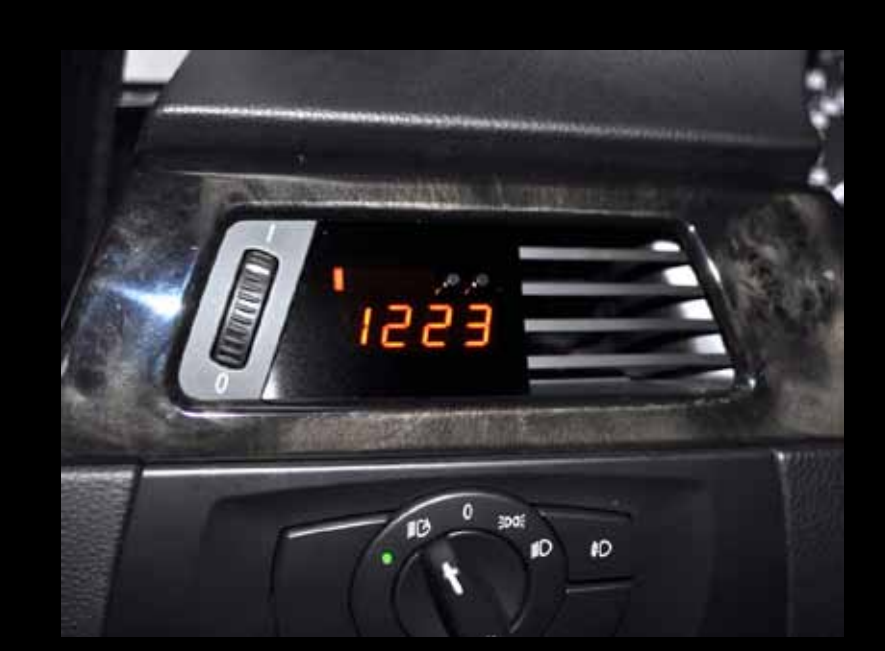
Start the engine and make sure the gauge turns on now that everything is hooked up properly, then fully re-install the vent and surrounding panels/trim.