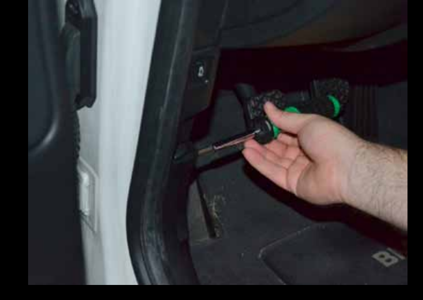
Remove the side kick panel cover screws, first remove the Phillips screw holding the hood pop lever, then the screw behind the lever. 2 screws total.