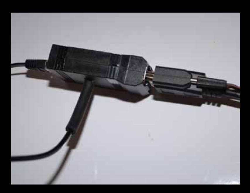
Connect the vacuum line and harness to the control box as shown. (note: for versions earlier than 2.1, the vacuum port is on the harness)