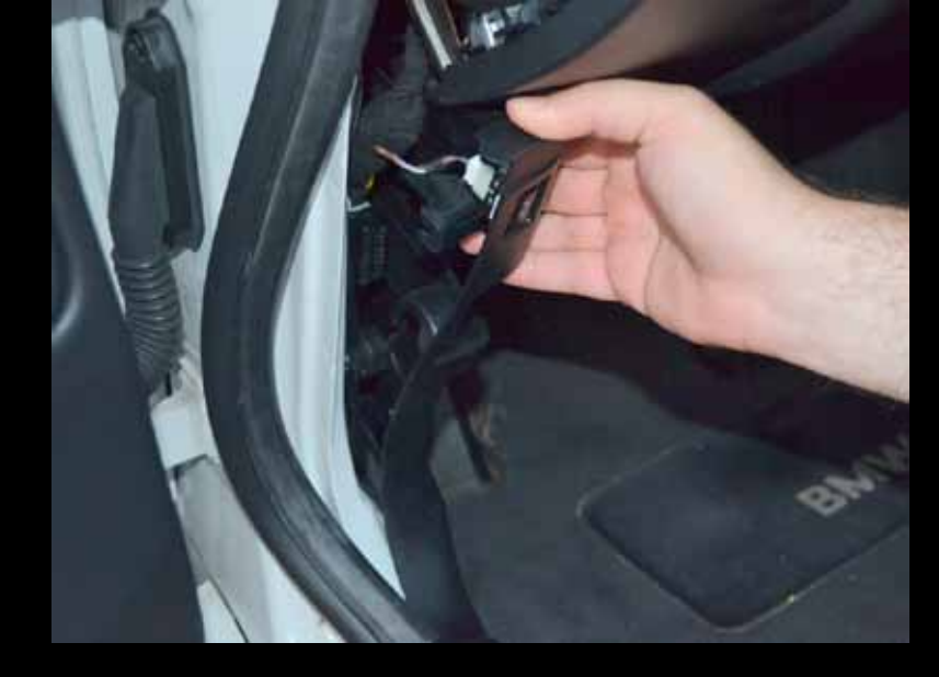
Flex this panel forward to get access to the OBD2 port and the trunk pop switch. You will need to pull the rubber door seal forward to free the panel.