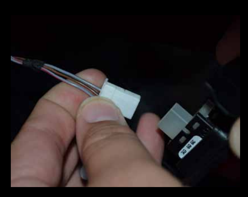
(Optional) To use the auto dimmer, D.On.A function of the gauge, connect the GREEN harness wire to the Red/Gray wire on the TRUNK POP SWITCH with the T-Tap connector. If you do not tap this wire for dimmer, you can use the one-touch manual dimmer option on the gauge.