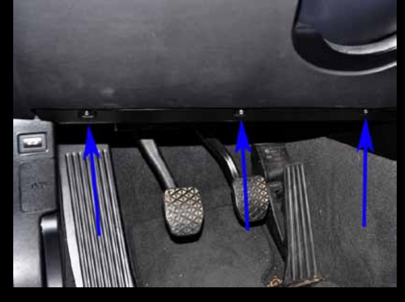
Remove the lower dash cover below the steering wheel by removing the three #20 torx screws shown here. Lay this cover down into the footwell.