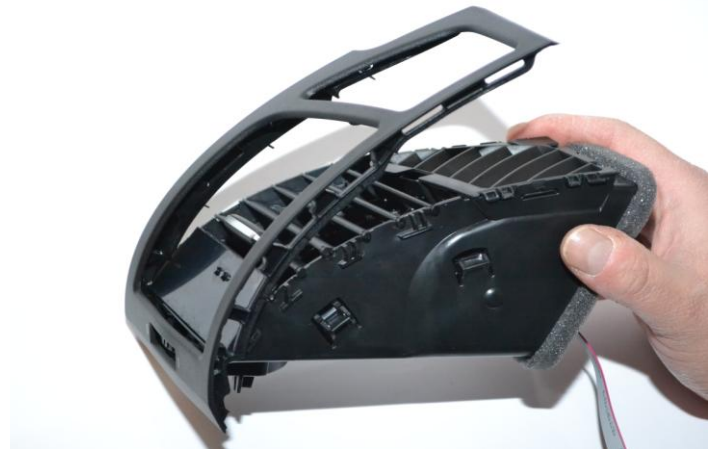
Step 8: Re-attach the vent face, starting at the bottom with the 2 circular clips.