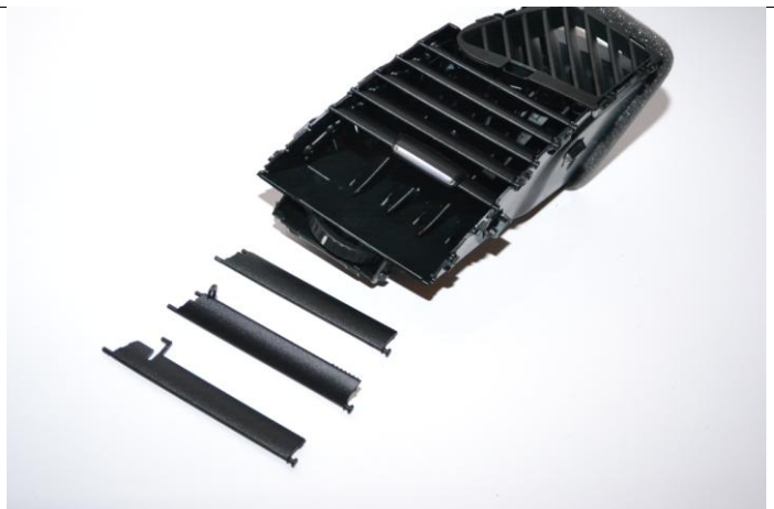
Step 4b: Your vent will now look like this.