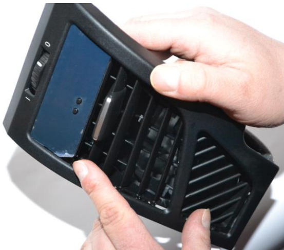
Step 9: Work your way up the vent clipping it back together, take care to make sure the metal tabs of the display are in the correct slots.