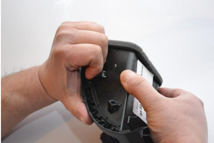
Step 1: Unclip the vent starting on the top right side.