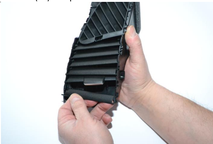
Step 4a: Remove the bottom 3 vent slats ONLY.