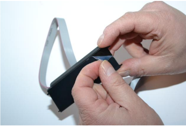
Step 5: Prepare the vent gauge display – peel off a corner of the protective cover for ease of removal later.