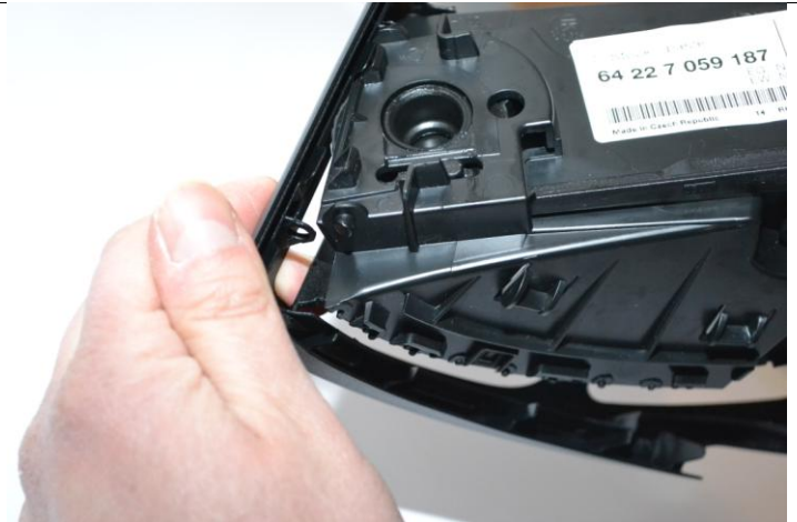
Step 3b: Remove the top of the vent completely