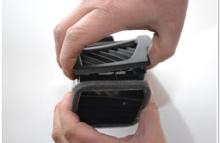
Step 2: Unclip the other side of the vent and pull it away, taking care to unclip the center clip in the middle of the vent.