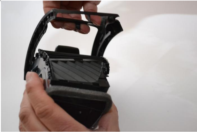
Step 3a: Remove the top of the vent and pivot it forward, and then (3b) unclip the bottom circular tabs.