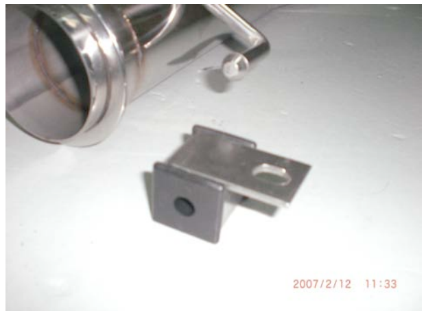
Each rubber mount has a FLAT plate on one side -FLAT plate must always be on top and resting against the car body