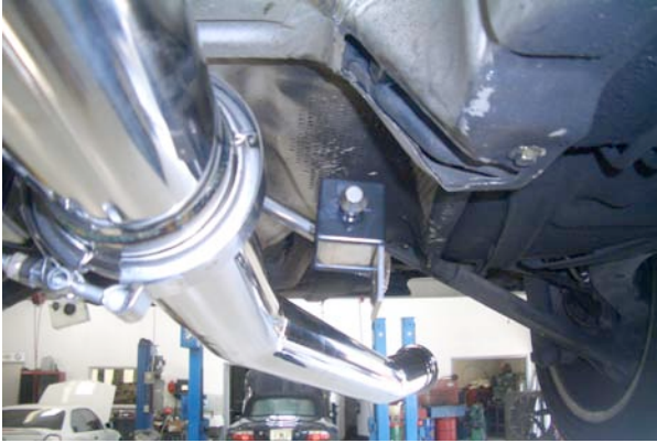
Same applies to the right side