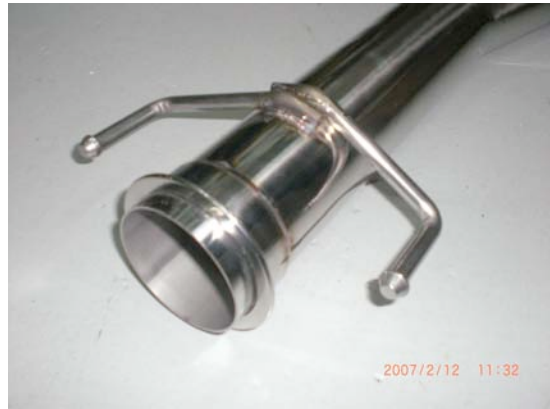
Mounting FRONT resonator to MID SECTION with mounting tabs