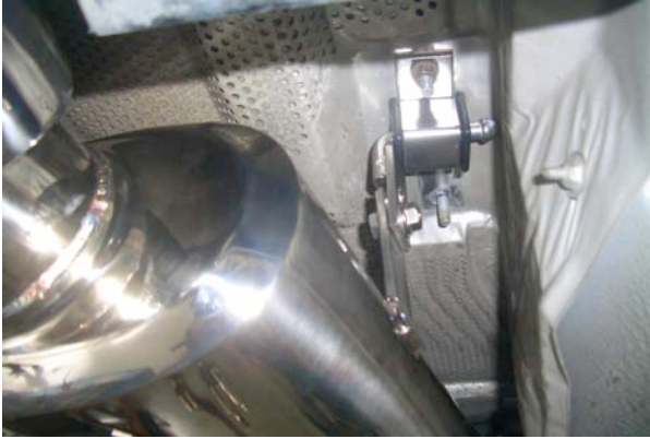
Passenger's SIDE -Use the SHORT BRACKET -Mount to outside of the muffler brace -Rubber mount bracket faces the rear of car