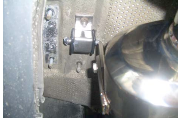
Driver's SIDE (LEFT Side) -Use the Long Bracket -Mount to inside of the muffler brace -Rubber mount bracket faces the rear of car