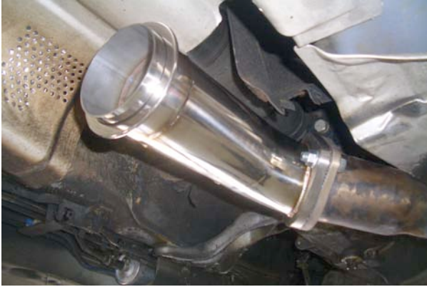
Mounting Front SHORT pipe with 3.0" exhaust gasket with bolts & nuts