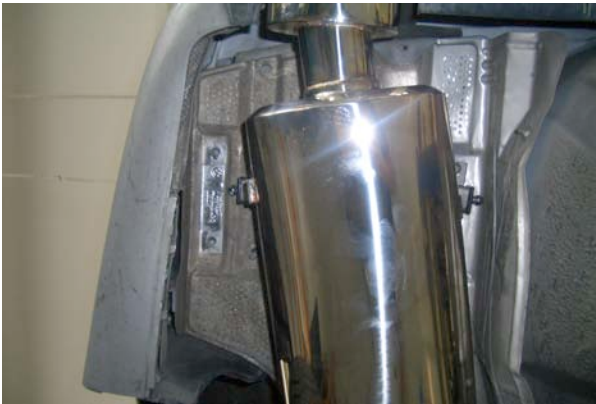
REAR Muffler INSTALLED