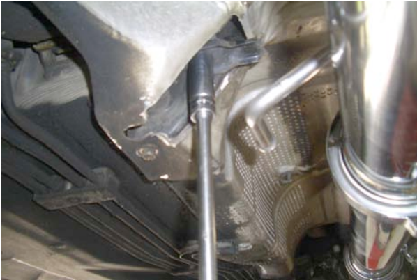
Mounting MID SECTION -Section with tabs are on top -Section with tab mounts towards the rear