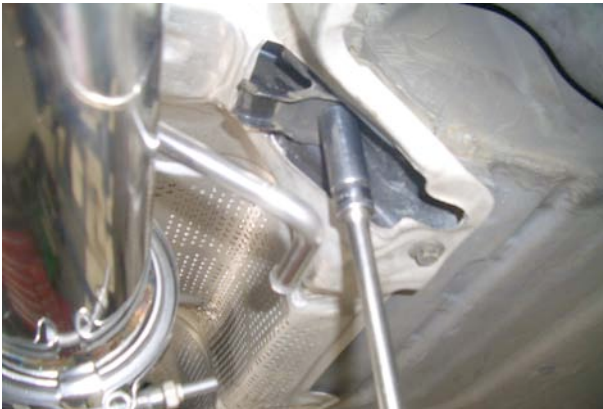
Remove existing Factory mounting hangers in the center body area -There will be one on each side of the driveshaft tunnel