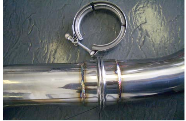
No gaskets required here. Only V-Band clamps are used