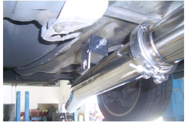
RACE Exhaust mount is a square rubber with a flat bracket on one side. -Make sure that flat bracket section of the mount is on TOP -Bracket has to rest against the chassis body when securely tightened