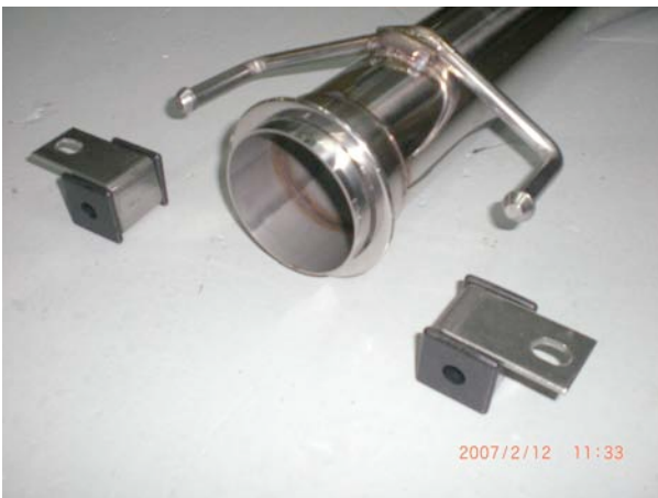
This is the MID SECTION with mounting tabs -Section with Tab ends faces the rear of the car -Tabs ends are to be on the TOP section of this pipe