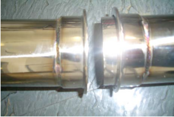
Each exhaust mounting section has a MALE and FEMALE end for a easier, more secure install