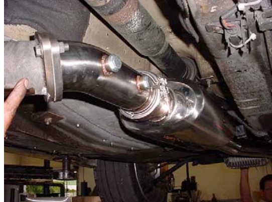
Mounting FRONT resonator or OPTIONAL straight thorough pipe with V-Band clamp to Front SHORT Pipe