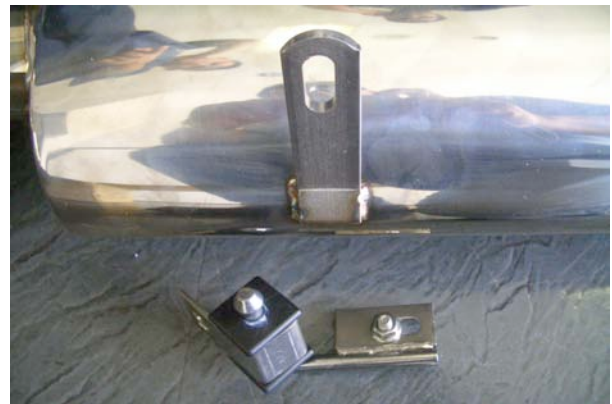
Installing the rear exhaust side brackets

To mount the Rear Muffler to the body, use the (2) brackets supplied - Short Bracket mounts on the RIGHT (Passenger Side) - Long Bracket mounts on the LEFT (Driver's Side)