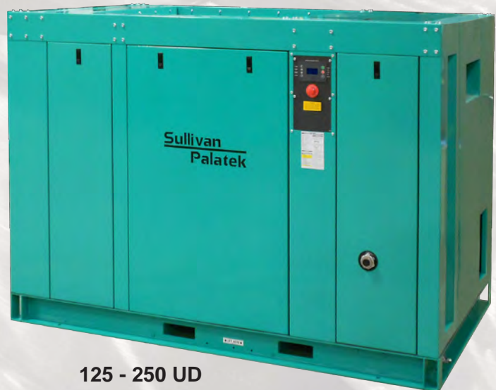
125 - 250 UD