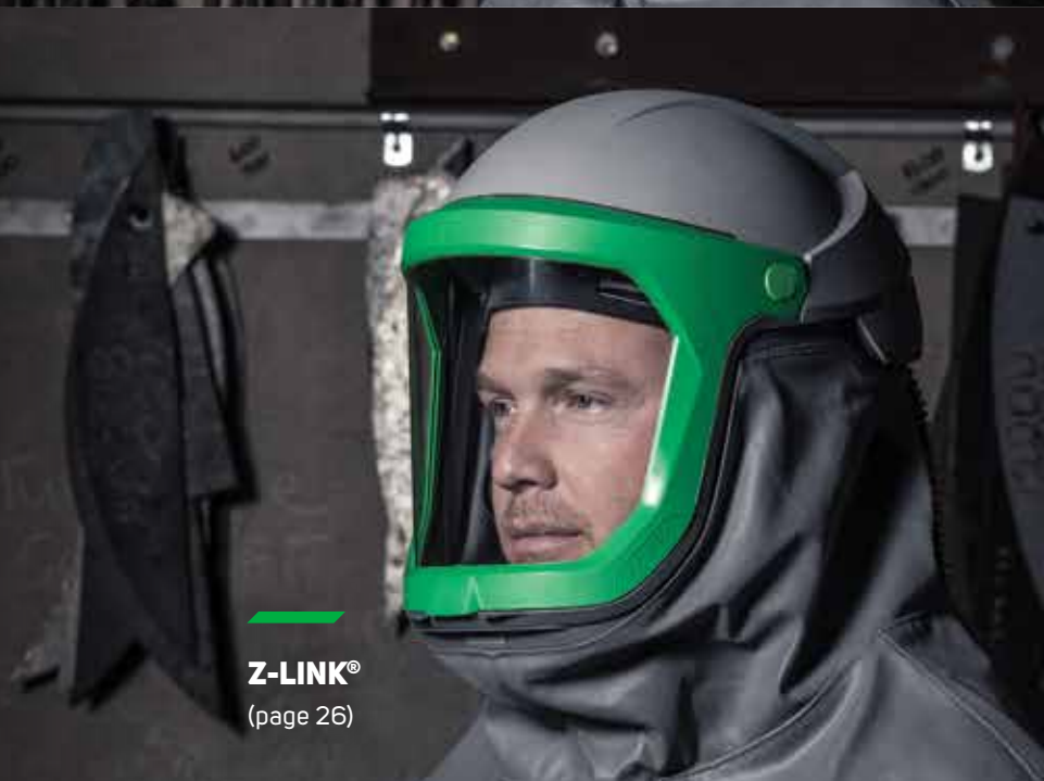
Z-LINK® (page 26)