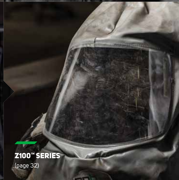
Z100™ SERIES (page 32)