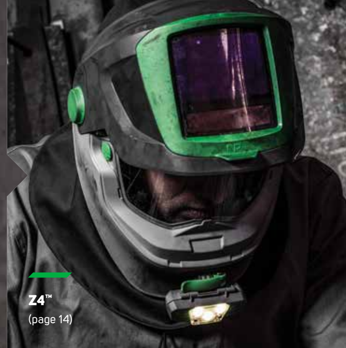
Z4™ (page 14)