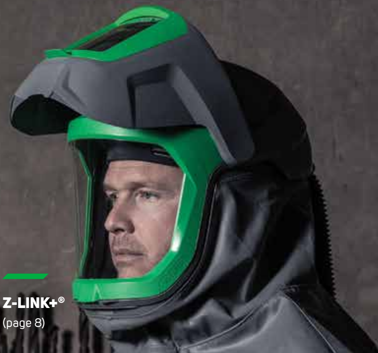
Z-LINK+® (page 8)