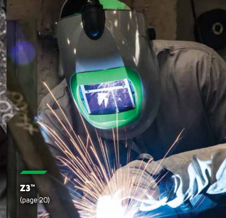
Z3™ (page 20)